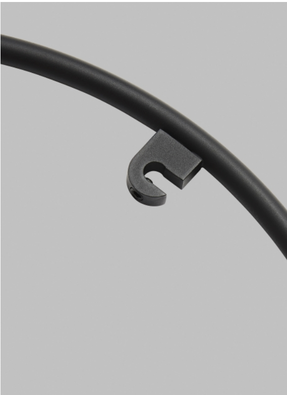
Hook Detail Black