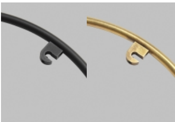
Hook Detail Black